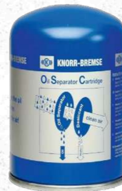
K039453X00 Knorr EconX Air Dryer Oil Separator Cartridge