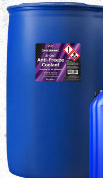
MIS16747 25L Anti-freeze Si-OAT