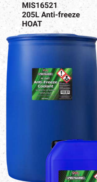
MIS16521 205L Anti-freeze HOAT