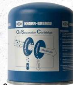
K163455 Knorr Bremse Desiccant Cartridge M41 x 2