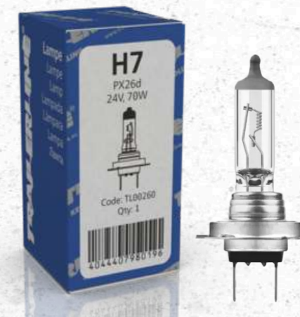
N499A 24V 70W PX26d H7 Bulb