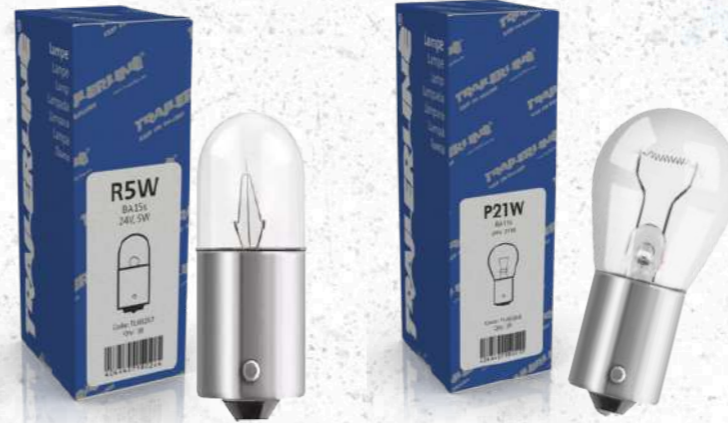
N149 24V 5W BA15S Bulb