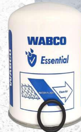
4324102227 Wabco Desiccant Cartridge M39 x 1.5