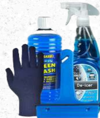
QUE110705 Winter Pack C/W Gloves