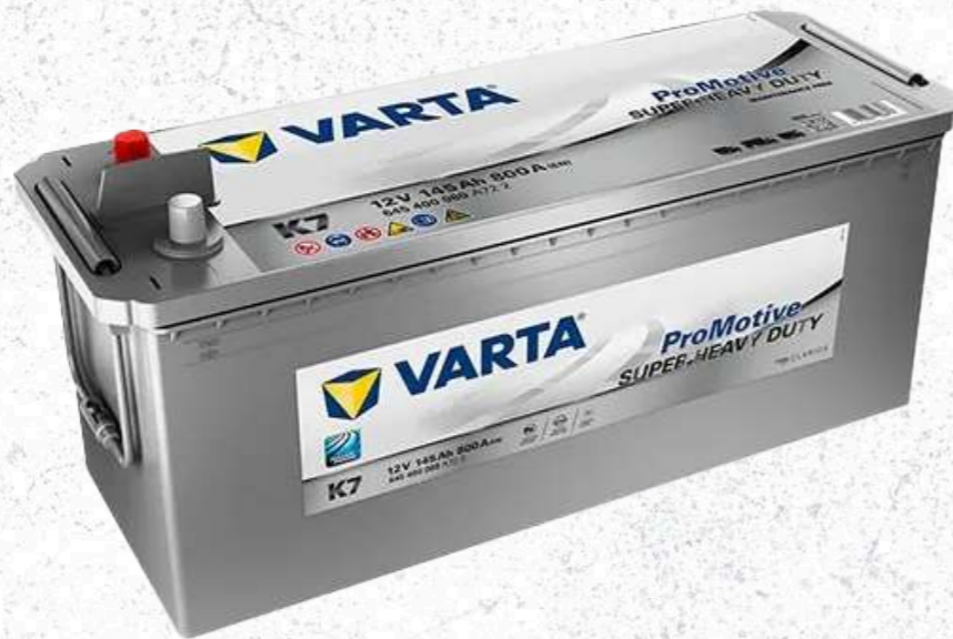
Varta 627 Promotive Silver K7 Battery 645400080