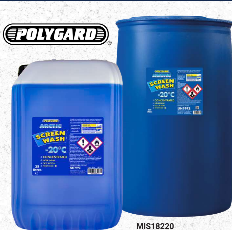
MIS18215 25L Screenwash -20 C

Be seen and stay safe with our exceptional range of torches and work lamps.