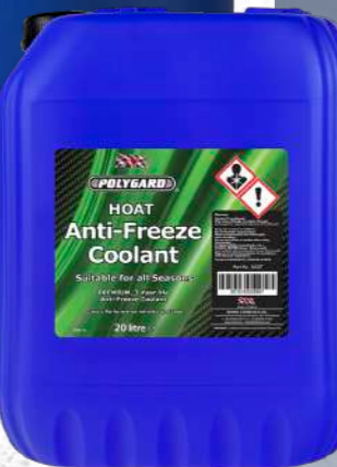
MIS16219 20L Red Anti-freeze Long Life