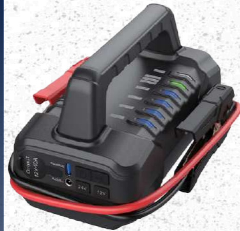
DUR064950 Heavy Duty Li-Polymer Jump Starter Pack

These indispensable tools are a must-have for every vehicle owner, providing a reliable and instant solution to get you back on the road, no matter how harsh the weather turns.