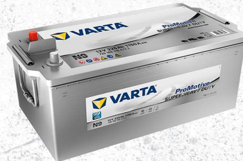
Varta 625 Promotive Silver N9 Battery 725103115

EMS stock a comprehensive range of batteries to suit all vehicles.