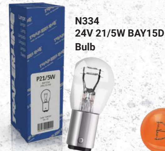
N334 24V 21/5W BAY15D Bulb