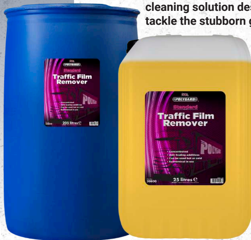
MIS20802 205L Standard Traffic Film Remover

Polygard Traffic Film Remover stands out as a highly effective, industrial-strength cleaning solution designed specifically to tackle the stubborn grime, road film, and general dirt build-up that accumulates on all types of vehicles.