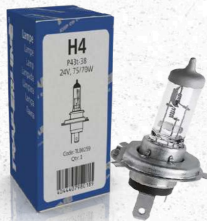
N475 24V 75/70W P43T H4 Bulb