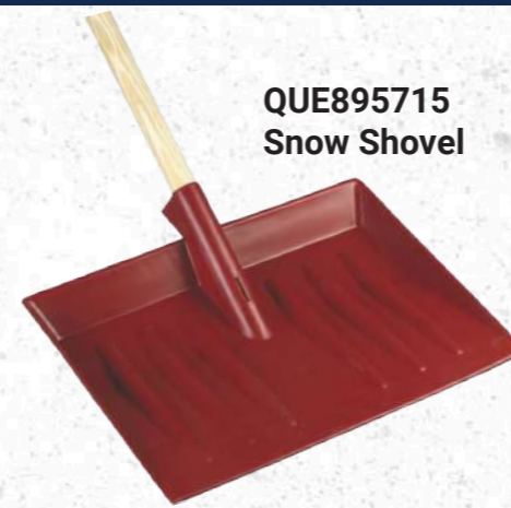
QUE895715 Snow Shovel