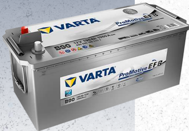
Varta 629 EFB Promotive B90 EFB Battery 690500105