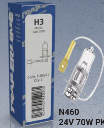
N460 24V 70W PK22S H3 Bulb