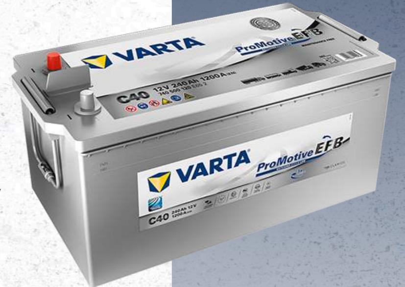
Varta 625 EFB ProMotive C40 Battery 740500120