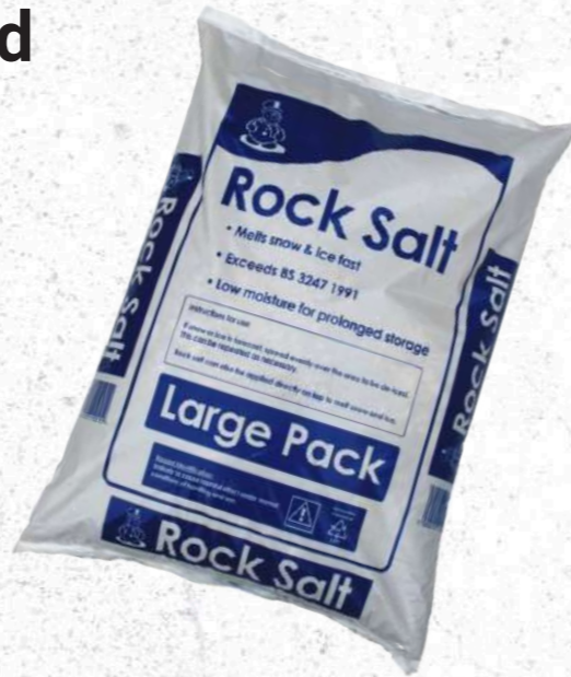
QUEP70600 23kg Brown Rock Salt Bag

Stay protected when the temperatures drop.