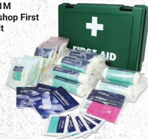
SFA01M Workshop First Aid Kit