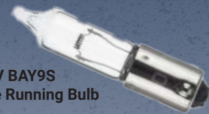
64138 24V 21V BAY9S Daytime Running Bulb

Conveniently available at your local EMS depot.