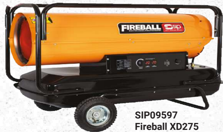
SIP09597 Fireball XD275 Diesel Space Heater 275,000 BTU

The Fireball XD275 diesel space heater is an effective heater offering power and continuous heat for large workshops, warehouses and garages.