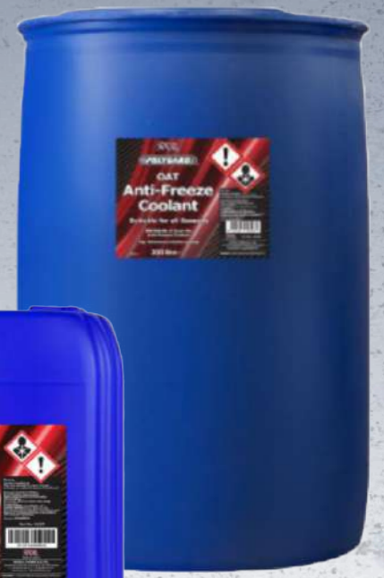
MIS16230 205L Red Anti-freeze Long Life

Anti-freeze guarantees optimal engine performance and protection against extreme temperatures, preventing both freezing in harsh winters and overheating during summer, ultimately minimising downtime.