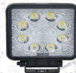
ERM910174216 Ermax 1800 Lumen LED Working Lamp 9-32V