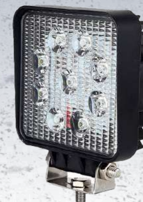
DUR042046 Work Lamp 3w 9 x LED 12/24V

Polygard screenwash, known for its effective cleaning power and dependable performance, is now readily available in all volumes at your local EMS depot.