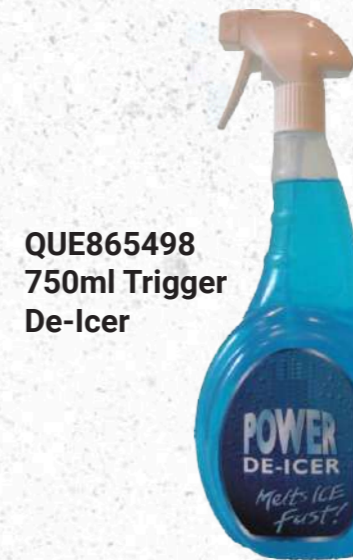
QUE865498 750ml Trigger De-Icer