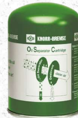
K039454X00 Knorr Bremse Cartridge M39x1.5