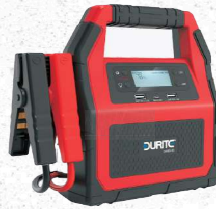
DUR064940 12/24V Jump Starter 42000mAh Li-Polymer Battery