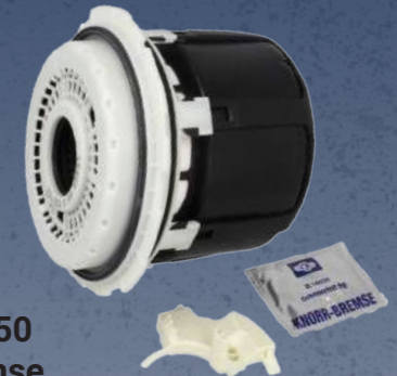
K096837K50 Knorr Bremse Desiccant Cartridge

Protect your air system with genuine Knorr-Bremse air dryer cartridges, engineered for reliability, safety, and a long service life.