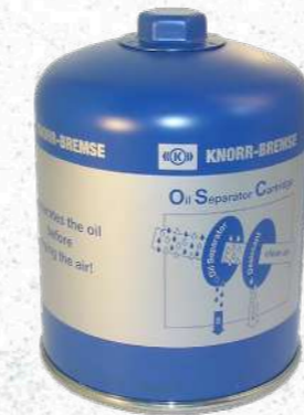
K087957 Knorr Bremse Desiccant Cartridge with oil separator, M41x2