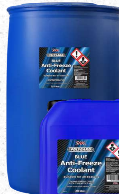
MIS16420 205L Anti-freeze Blue