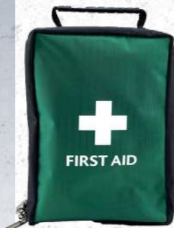
QUE895670 Large Vehicle First Aid Kit

Essential first aid kits designed to address everything from minor cuts and scrapes to more serious injuries, providing immediate care when every second counts.