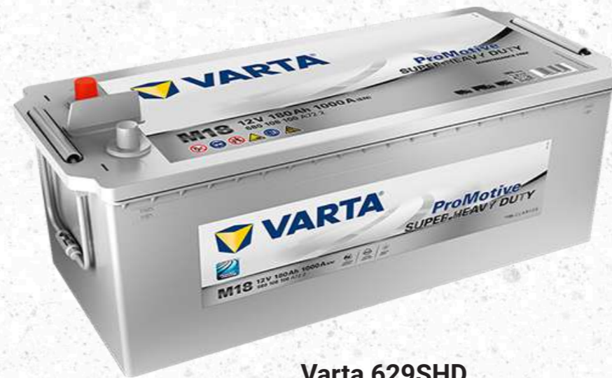
Varta 629SHD Promotive Silver M18 Battery 680108100