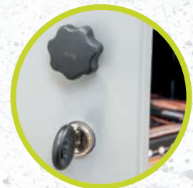
Safe and Secure

Stay in control of your stock and protect valuable items. Each modular draw and cabinet unit is fitted with its own robust locking mechanism, so you can secure tools and consumables individually, ideal for shared workspaces or high-traffic areas. Peace of mind, built in.